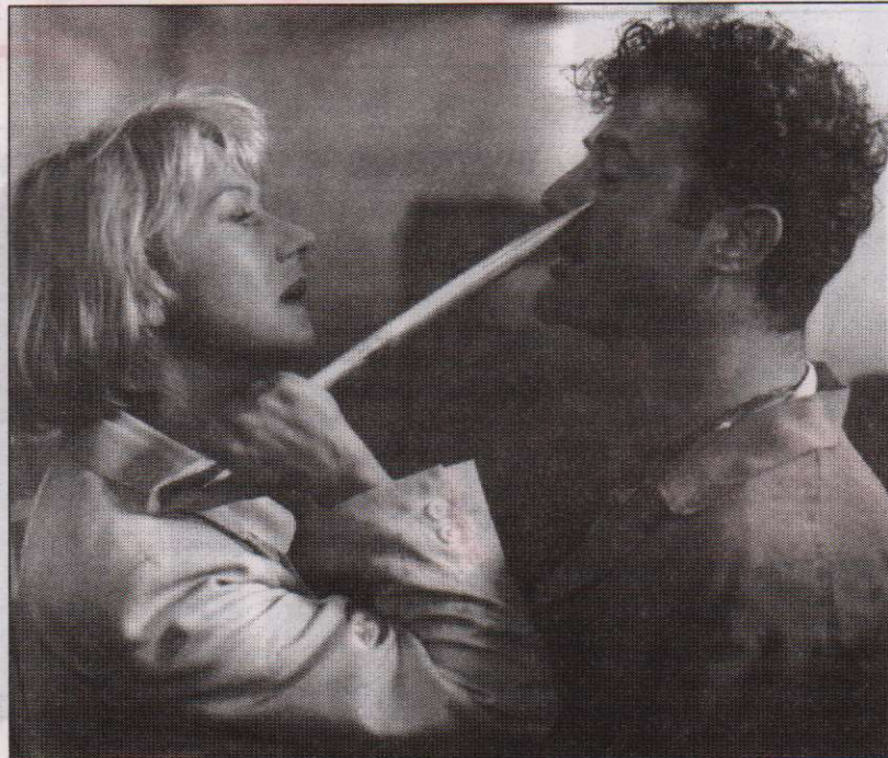
Annie Marsh (Helen Mirren) confronts her brother-in-law (Owen Teale) with a large pointy stick

M OST OF THE major studios released their Christmas blockbusters weeks ago and so this week's best new release is a low budget British film on the appropriate Xmas theme of serial killers.