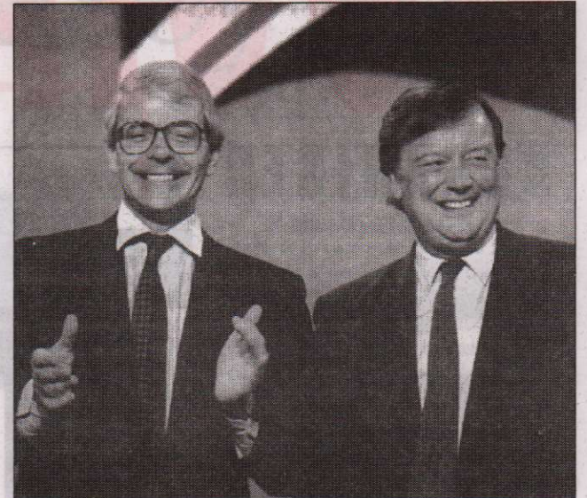
Out to solve their problems at our expense